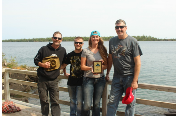
The Second Place Fish Nautzi Crew