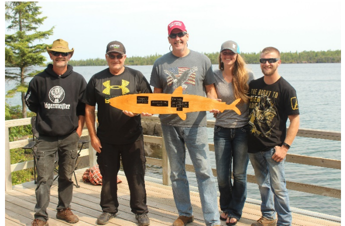
The Minnesota Fishermen with the Wooden Herring Award

The Minnesota fishermen maintained a strangle hold on the coveted Wooden Herring Award with a total weight of 64.1 lbs. Congratulations to the Minnesota Fishermen!