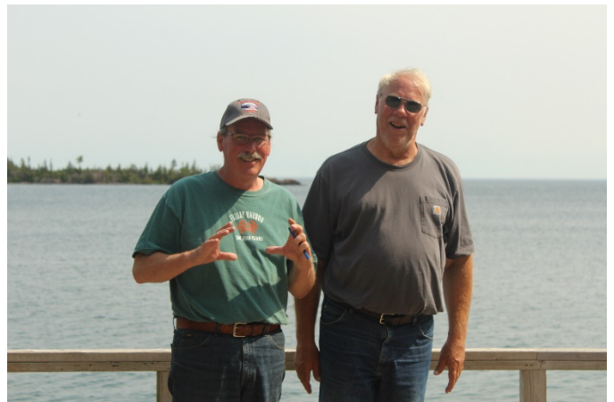
The 'Miss Laurie' Partial Crew