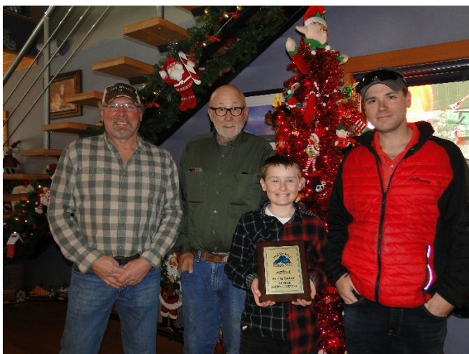
The First Place Barbara Jean Crew